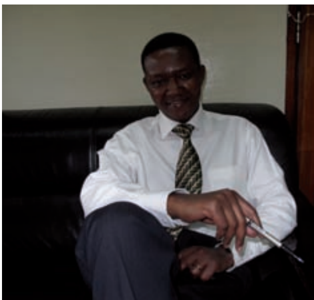
Government spokesman Dr Alfred Mutua