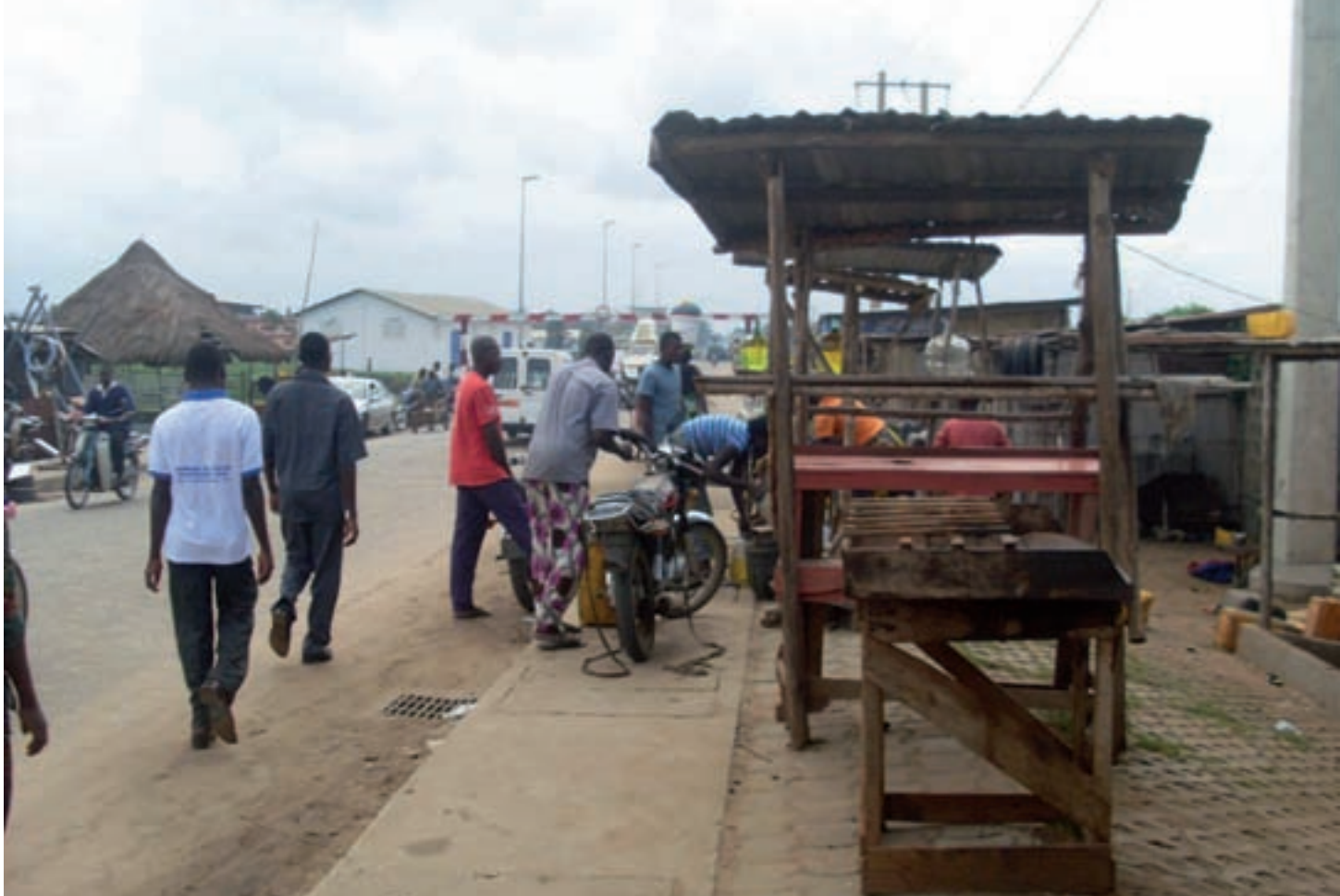
A motorcyclist fills up at a roadside petrol station