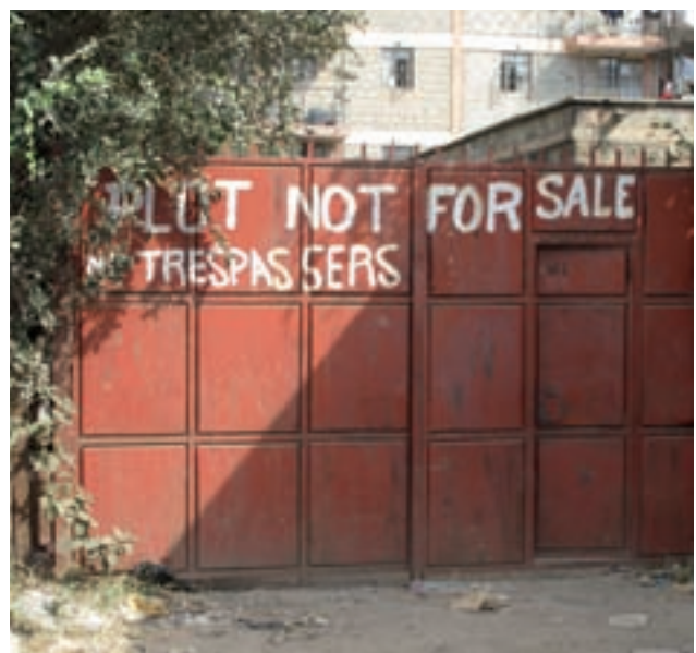
Plot holders in Nairobi are being forced to put up signs that their plots are not for sale