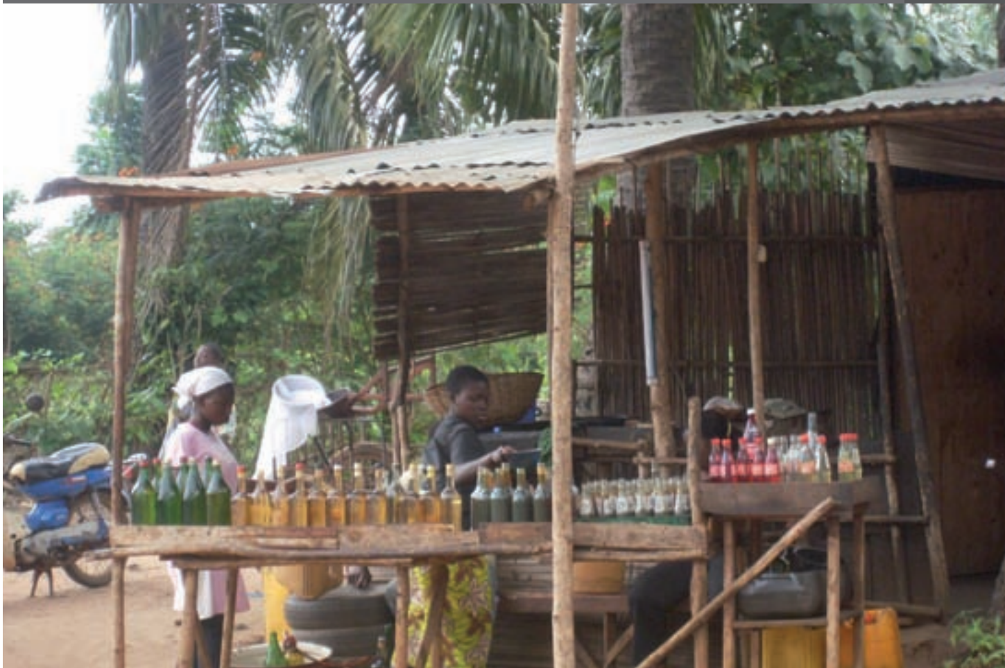
Petrol on sale on the road side in Cotonou