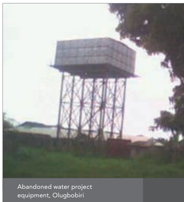
Abandoned water project equipment, Olugbobiri